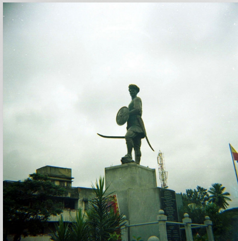
Statue of Sangolli Rayanna at Bengaluru Karnataka